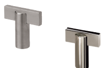
Möbelknopf Vertic 1 K inkl. Schraube M 4