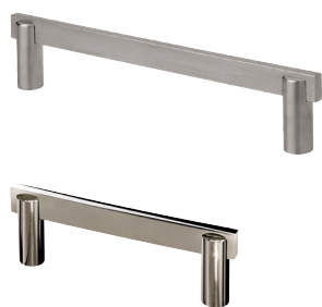
Möbelgriff Vertic 1 Griffprofil 15 x 6 mm, inkl. Schrauben M 4